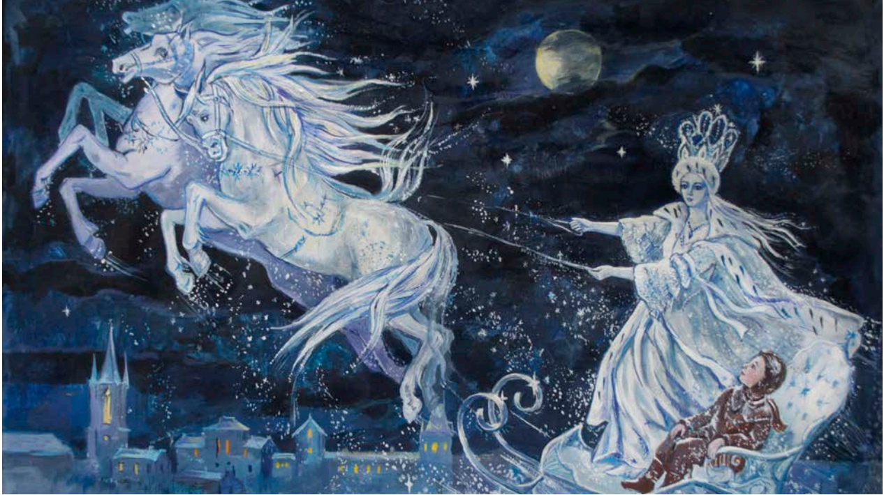
The Snow Queen by Hans Christian Andersen